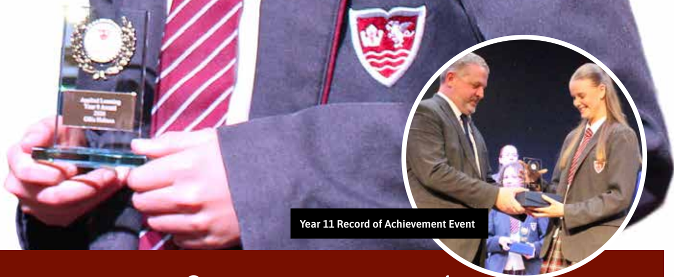
Year 11 Record of Achievement Event