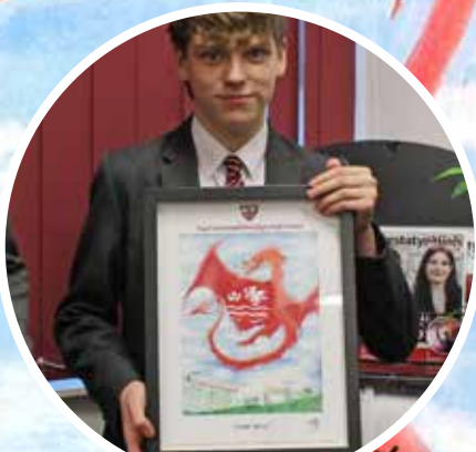
Celf Gymraeg yn y Senedd - Tudalen 3