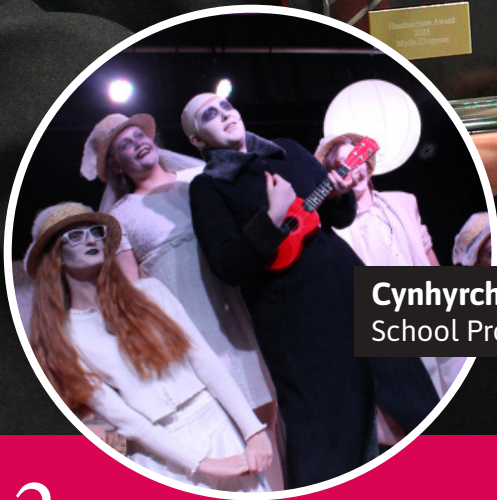
Cynhyrchiad Ysgol School Production