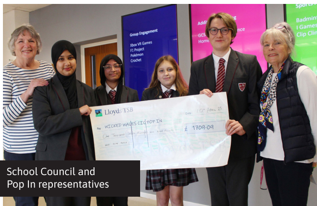
School Council and Pop In representatives

£1707.09-Medicinema/Alder Hey, £1707.09 Jessie May-Children's Hospice and £1707.09 Food Bank/Pop In.