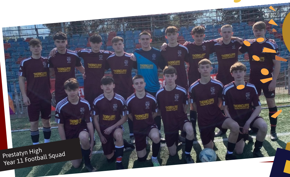
Prestatyn High Year 11 Football Squad