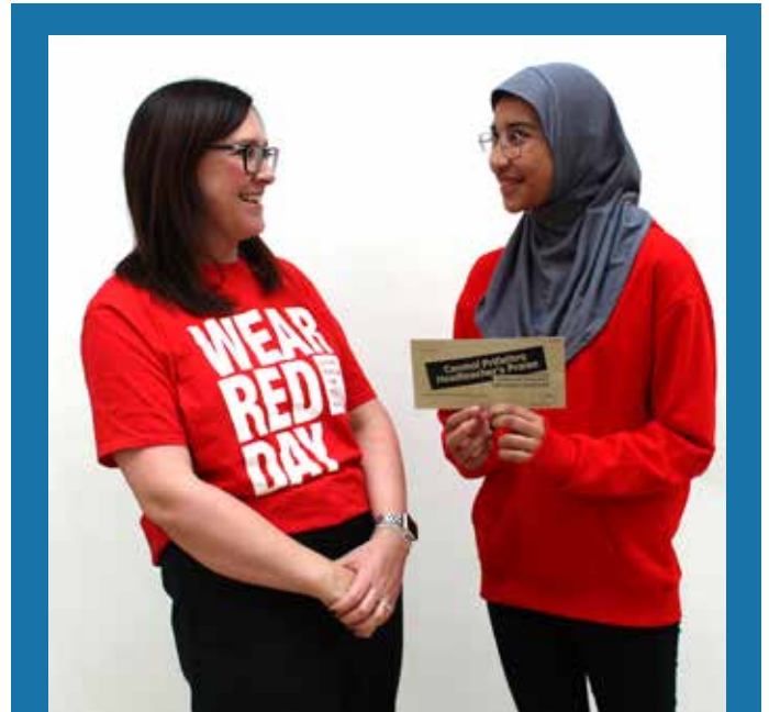
Prestatyn High @PrestatynHigh 18 OCTOBER 2024

Headteacher's Gold Praise Postcard for a Year 7 pupil. Given for a powerful and creative poem that she wrote for the poetry competition.