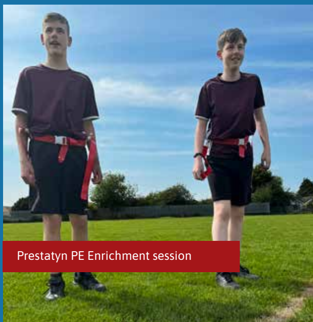
Prestatyn PE Enrichment session

Great sunny evening of @EnrichmentPHS NFL Flag Football & Tennis @PrestatynTC @jjstennisaces @NFLFLAG