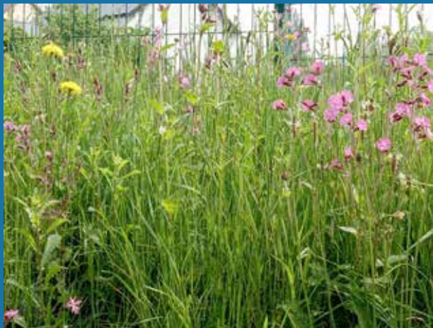
Prestatyn High @PrestatynHigh MAY 2024

The beautiful wildflower area behind the library is now established thank you @phs_go #nature @Keep_Wales_Tidy @WGClimateChange