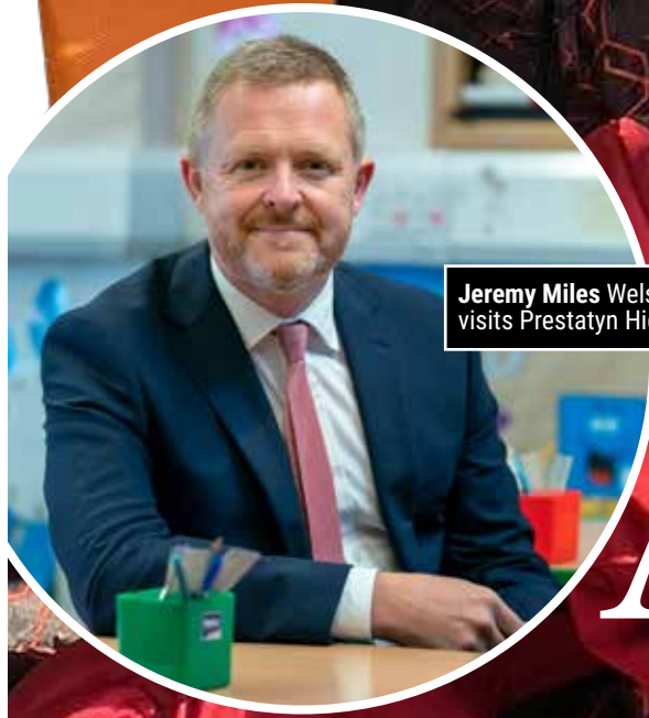
Jeremy Miles Welsh Minister for Education visits Prestatyn High School Page 2