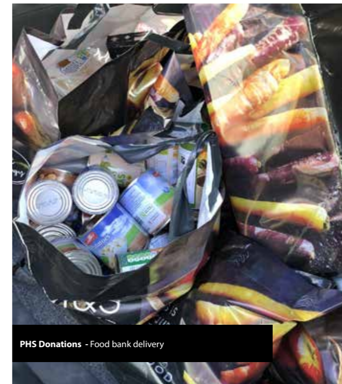
PHS Donations - Food bank delivery

So far, we have received many generous donations, both online and in school, for the local Food Banks. In total we have raised £2682.65 , which is amazing! We have continued to distribute this between King's Storehouse, Prestatyn and Meliden Food Banks. Thank you for your contributions.