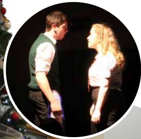
Blood Brothers School production. Page 2